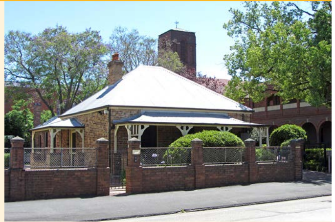
Arrupe Place, Parramatta

“We were drawn together with the common goal of providing a safe haven that allows asylum seekers to live with dignity and become